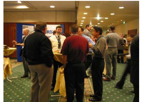
In depth discussions in the exhibition area during a break