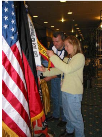
Sorting out the SAME Kaiserslautern Post flag and streamer awards